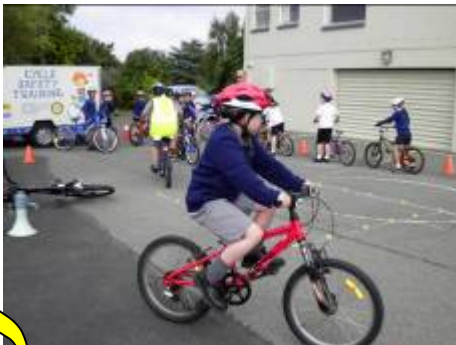
Room 5 photos taken by Marcus Talib