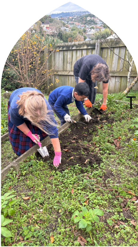
Another garden cleaned up and ready for planting