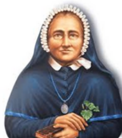
Venerable Suzanne Aubert New Zealand's First Saint in the Making

Since Suzanne Aubert's death on 1 October 1926, people from all walks of life have acknowledged her goodness and holiness. Today, she lives on in the hearts and minds of New Zealanders and people throughout the world as the process continues for the Catholic Church to recognise her as a holy person or saint